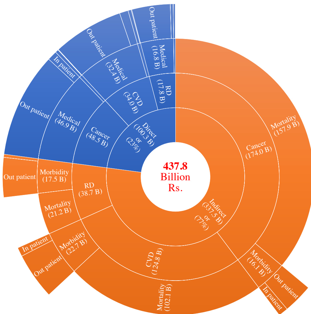
Figure 3. Major components of total cost of tobacco use to Pakistani economy

The smoking-attributable direct and indirect expenditures amount to a total of Rs 437.76 billion ($2.74 billion) (Figure 3). The direct cost is 23 percent of these expenditures. The indirect mortality cost is the biggest component, with a 64-percent share. Sixty-five percent of the total cost is borne by rural residents, and males account for Rs 382 billion ($2.39 billion) or 87 percent of the overall cost. Lastly, 82 percent of the total cost is accounted for by the 35–64 years age group.